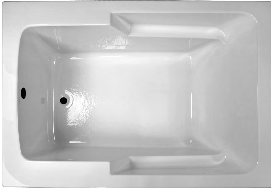
Shown with standard LX whirlpool system (silver upgrade package). Also available as an air tub or soaker

LX PREMIUM TUBS Soaker • Whirlpool • Air