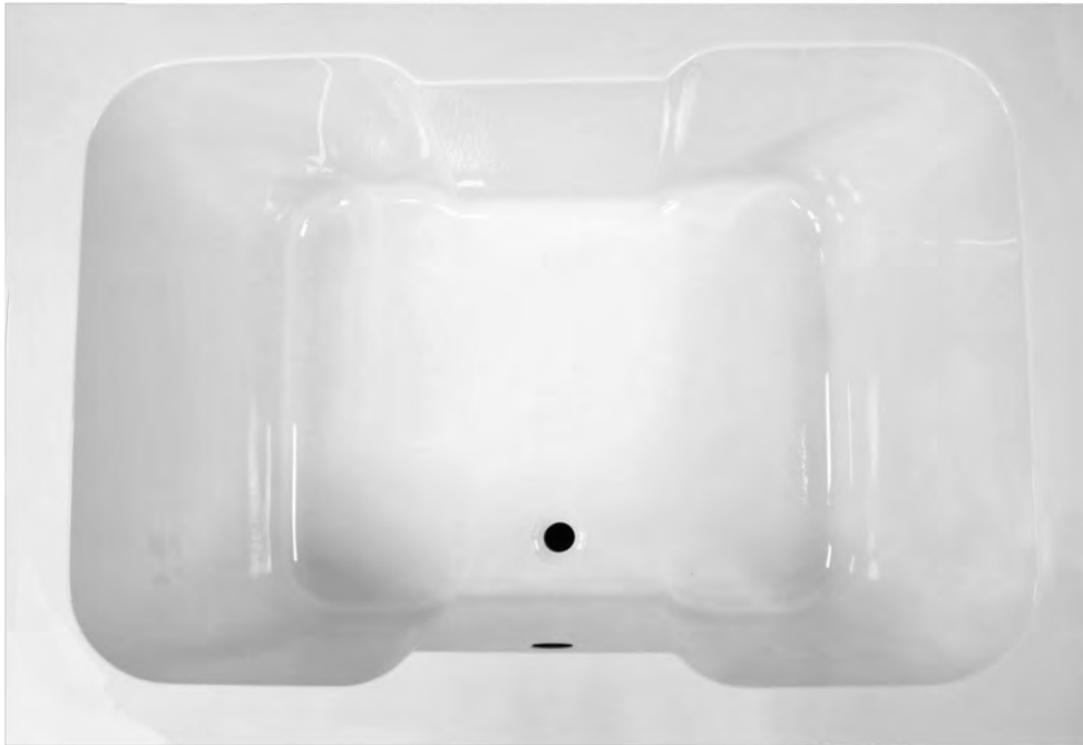
Shown with standard LX whirlpool system (silver upgrade package). Also available as an air tub or soaker